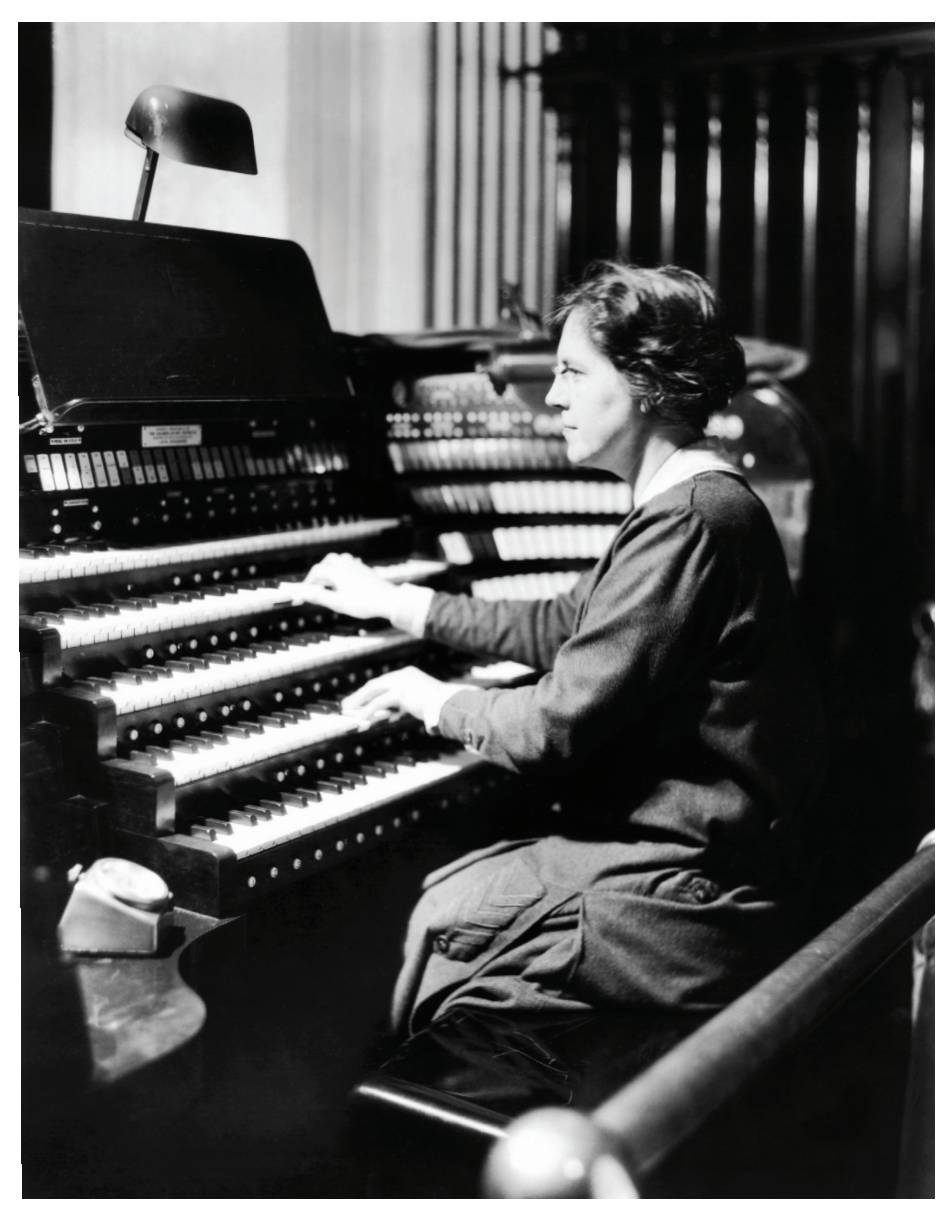
Nadia Boulanger, proclaimed in 1925 "The World's Foremost Woman Organist"

bound together by their shared Catholic beliefs. Poulenc's Salve Regina evinces the same introspection that suffuses Duruflé's motets. Messiaen's only motet for unaccompanied chorus, O sacrum convivium! , is similarly lush yet devout.