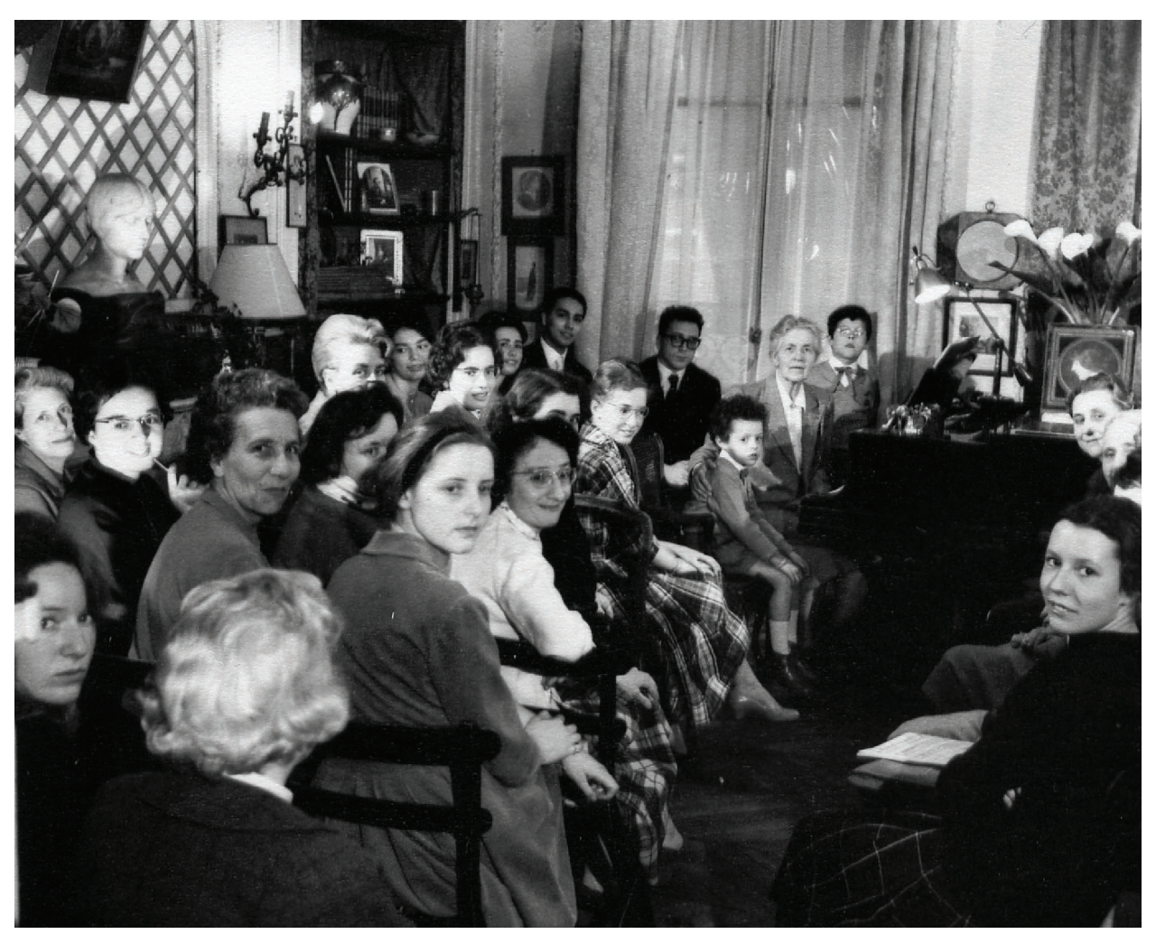
Cantata class at rue Ballu in 1960 (Nadia Boulanger at piano).