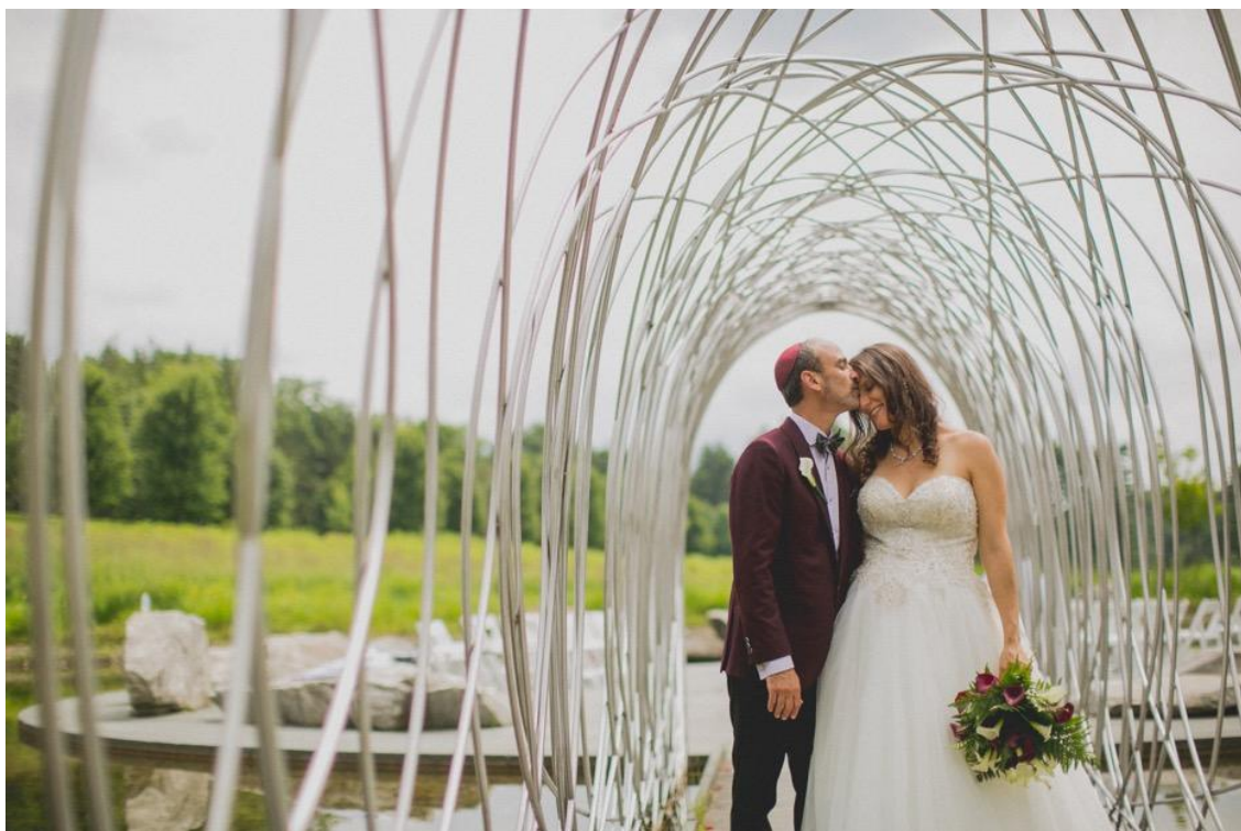
Olafur Eliasson's parliament of reality , a permanent installation at Bard College